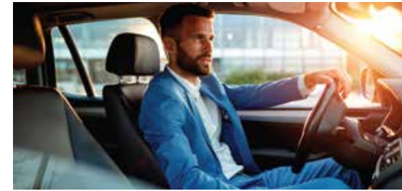
TRANSFERABLE WARRANTY INCREASED VALUE